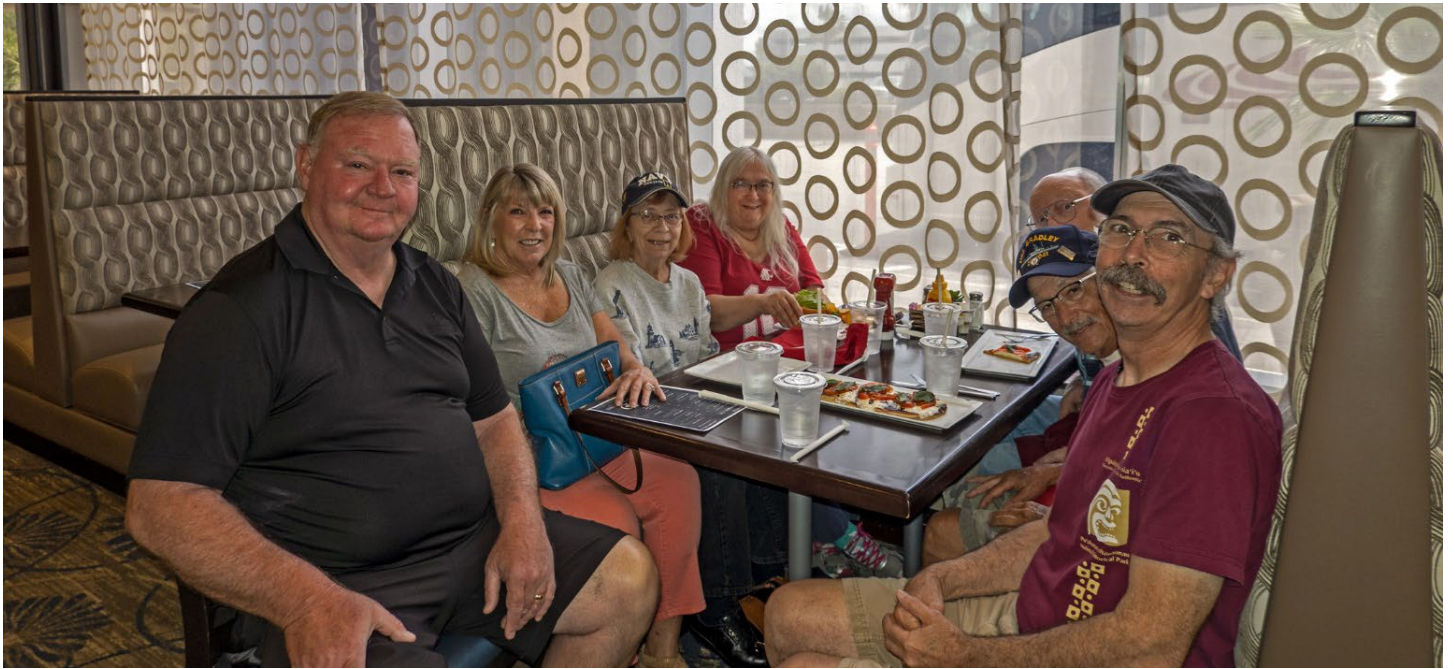
Members by State