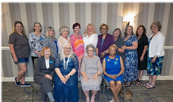
Wives, Family, and Friends of Bradley Shipmates